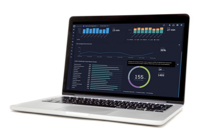
(Fig 3) Custom dashboards for provable ROI

We continue to help you minimize costs and maximize the value of your investment by relieving you of the burden of backend maintenance (including version updates and application performance) and performing Quarterly Service Reviews , health checks, and resolution of visibility gaps to ensure your SIEM is always correctly configured and optimized. (Fig 2)